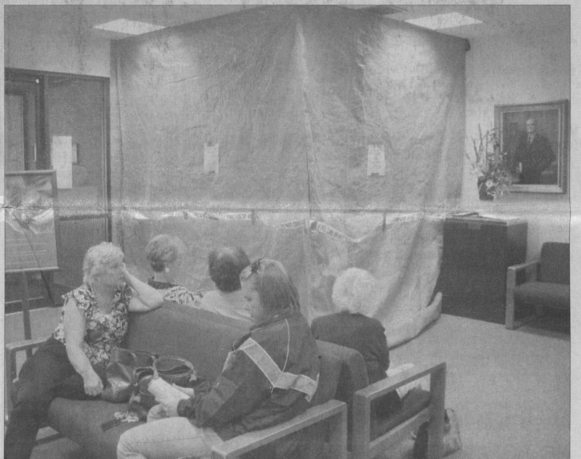
Rice Medical Center has begun work on remodeling the waiting area at the hospital. Tarps and safety markers cordon off the area being worked on.

The next meeting of the board was scheduled for 6:30 p.m., Aug. 1, to review the water code and state law on water districts.